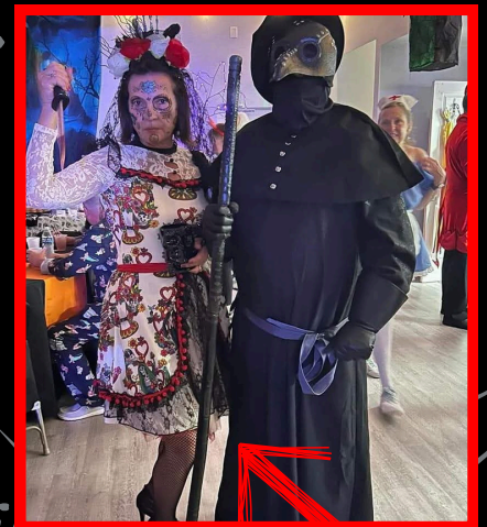
NO CANDY CONFLICT HERE! THE HACKERS ARE UNITED IN THEIR LOVE FOR CANDY CORN